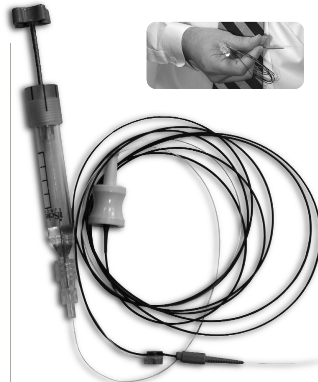
New innovation in sight. This micro-catheter, used in iScience Canaloplasty, offers a safer, minimally invasive alternative to surgery for glaucoma patients.