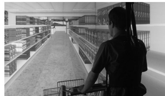
Finding balance in the virtual grocery store at UPMC Center for Balance Disorders

Patients at the UPMC Center for Balance Disorders benefit from the Center's Vestibular (Balance) Laboratory, a specialized facility designed to offer a wide variety of tests to determine the cause of the dizziness and balance problem. Once the cause is determined, an effective treatment plan is designed for the patient, which commonly involves a combination of therapies, including medications and physical therapy. Research has shown that the use of customized treatments improves balance